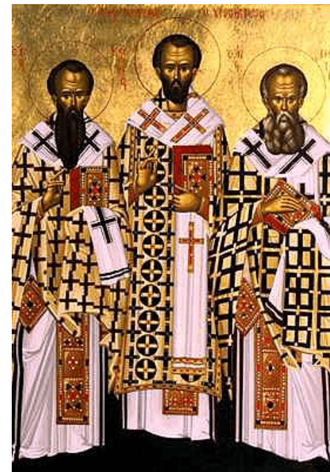
The Three Holy Hierarchs Patron Saints of MIOCS St Basil the Great, St Gregory the Theologian and St John Chrysostom